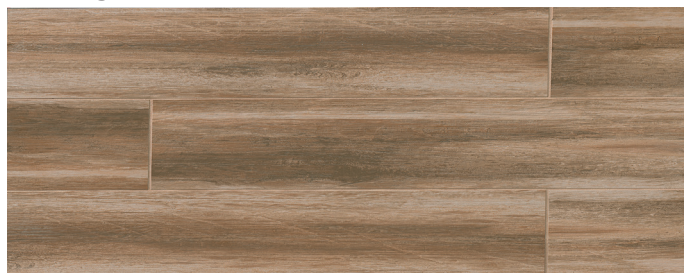
TCRWD26C - 8" x 24" TCRWD29C - 8" x 36"