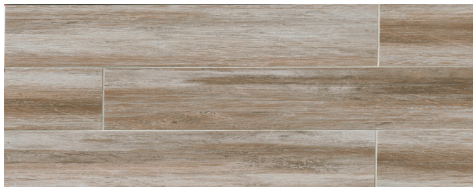
TCRWD26B - 8" x 24" TCRWD29B - 8" x 36"