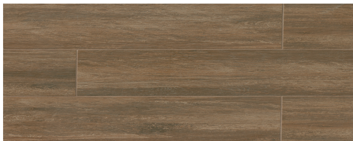
TCRWD26N - 8" x 24" TCRWD29N - 8" x 36"